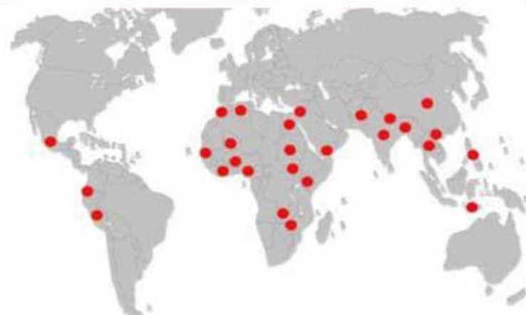
PPD Consultant Network 27 Countries in 4 Regions

Phase I : Sharing and Promoting Southern Expertise Phase II : Expand Market and Sustain Developing Country Experts